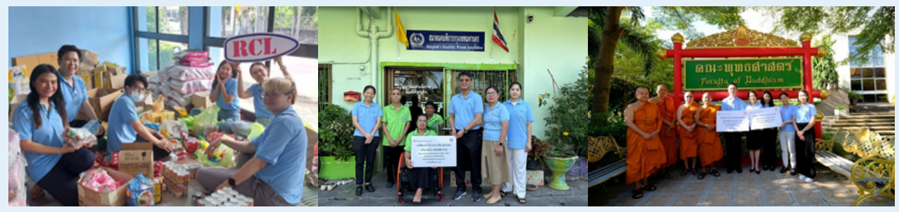
Flood Relief Donation to Ayutthaya Province