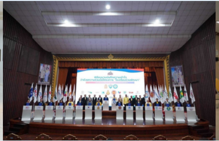
Donate to The Chaipattana Foundation Signing Ceremony for the Memorandum of Understanding (MOU) on the "Partnership School Project"