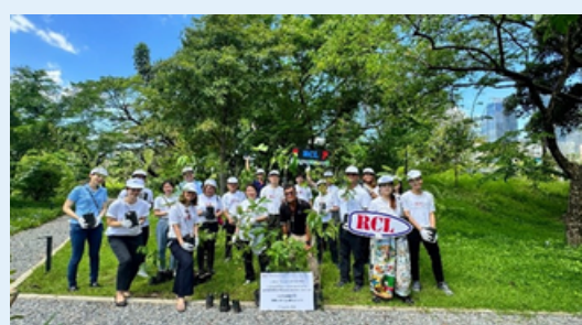
Green RCL, Green Earth," a tree planting campaign