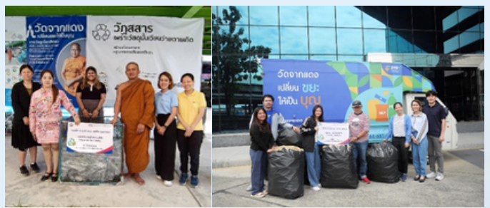
Donating PET Plastic Bottle to Wat Chak Daeng