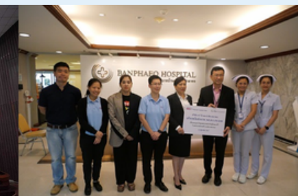
Donate to the Banphaeo General Hospital